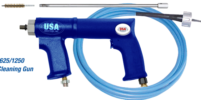
CG625/1250 Tube Cleaning Gun

Compact, powerful, reliable and easily maneuverable units used to clean straight and curved tubes in heat exchangers, condensers and boilers. Devices available as electric, pneumatic, or fast shot.