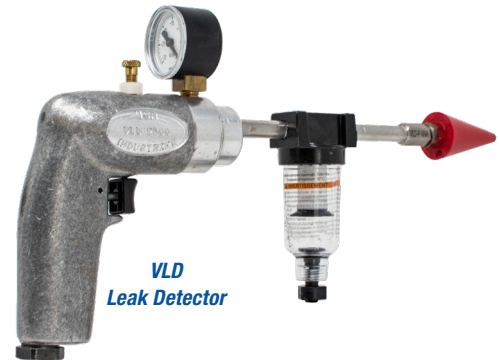
VLD Leak Detector

Quick and painless leak detection guns utilizing vacuum and pressure technology to create a quick seal for testing pressure. Shorten your test cycle with these near instant leak testing tools, saving you time and money.