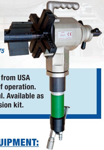
USA Superboiler T5

Lightweight, yet powerful pipe bevelers from USA Industries with easy set-up and speed of operation. Versatile, robust and extremely powerful. Available as electric or pneumatic to electric conversion kit.