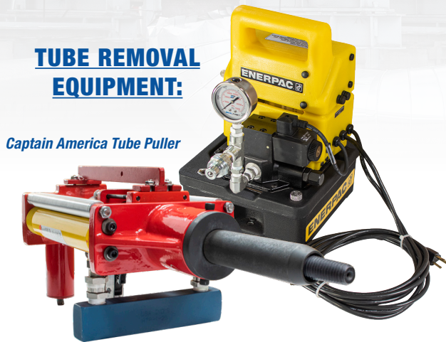
Captain America Tube Puller

Do you need pullers, collapsing or knockout tools? We carry a variety of products that cater to your project needs. Ask us about the Jenny, Spear Tube, Hollow Core and Collet pullers, plus more.